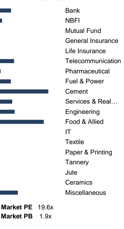
Figure: Sectorial Turnover (BDT Mn)